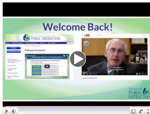
CTE Updates September 2016

Finally, please check out our latest video update for "What's new in CTE" and we wish you the best for a great year! To maximize your viewing experience, here is a link to the interactive slide presentation that is filled with links to valuable resources.