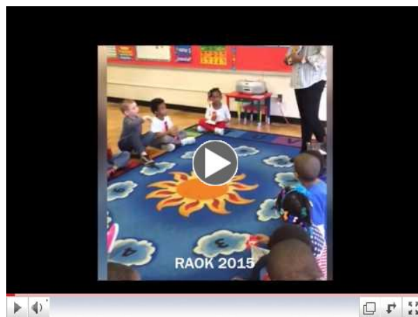
Green Bay Southwest DECA- EPIC Community Service Video