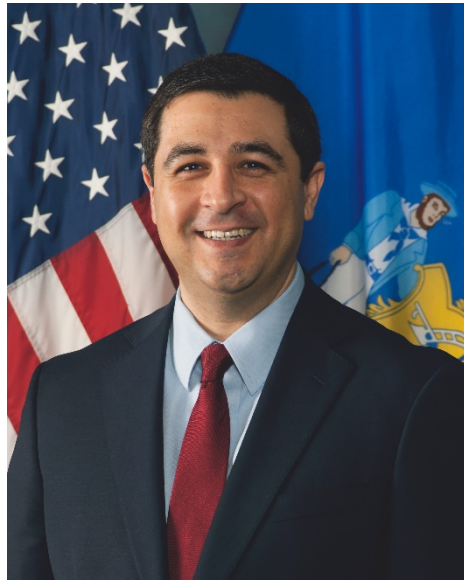
Attorney General Josh Kaul