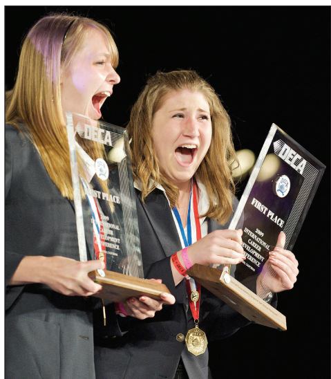
Competing against 10,000 of their peers, students vie to be named an international champion at DECA's annual International Career Development Conference.