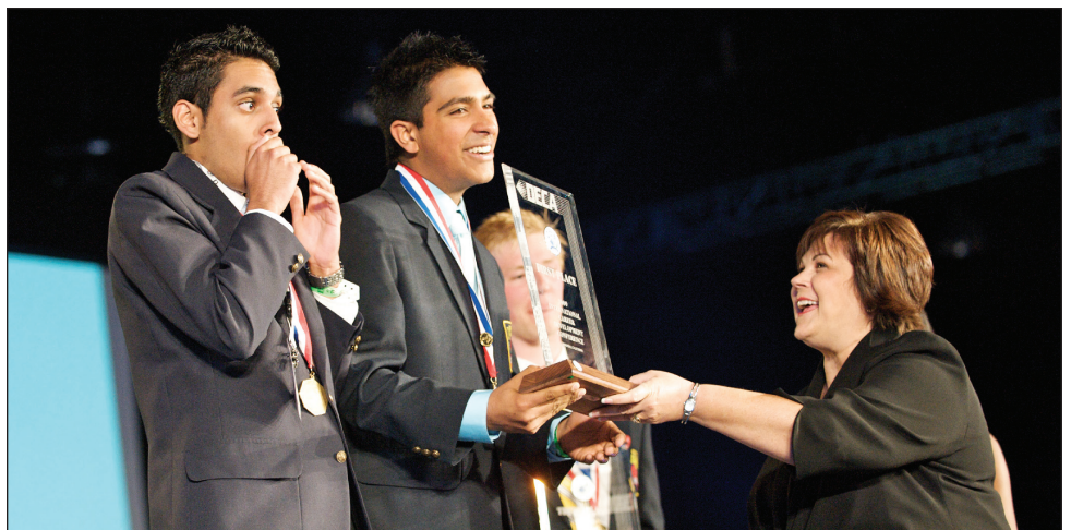
DECA's strong partnership with business and industry provides an unparalleled learning experience for members.

More than 800 industry professionals will serve as competitive events judges in their area of expertise at the ICDC.