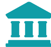
Government and Public Administration