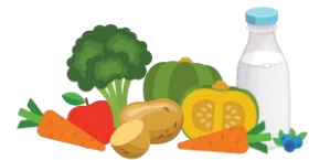
Nutritious • Delicious • Wisconsin

Nutritious, Delicious, Wisconsin can be coordinated with other Harvest of the Month activities, such as featuring Wisconsin-produced foods on the school menu or displaying promotional materials in the cafeteria. Wisconsin school districts are encouraged to use the Nutritious, Delicious, Wisconsin lessons and other toolkit Resources in their elementary classrooms, school cafeterias, and in the community.