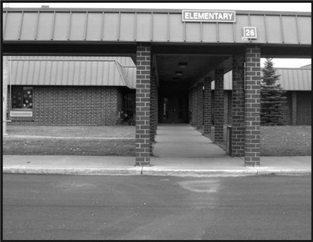
Entrance to the Elementary Building in Park Falls.