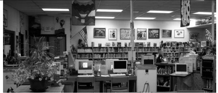
A portion of the library in the Glidden building.