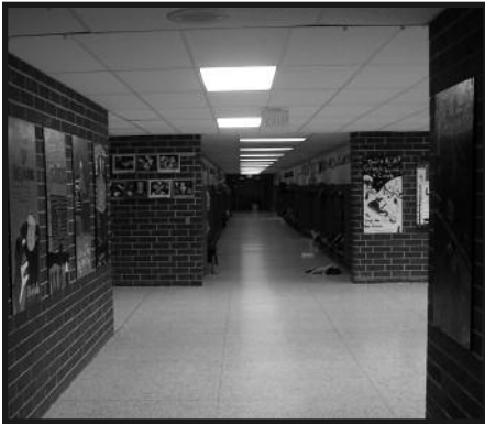
Elementary Hallway in the Park Falls building.

One of the Chequamegon Elementary Schools will be located in Park Falls. This is the projected floor plan where grades 4 and 5 will be combined after consolidation.