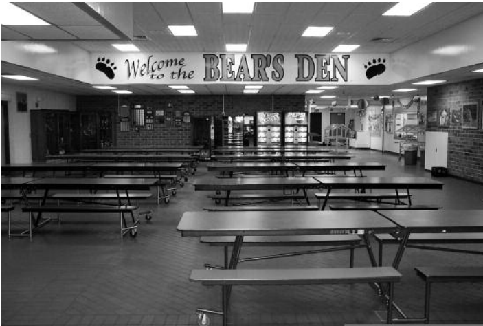
A view of the commons in the Glidden building.