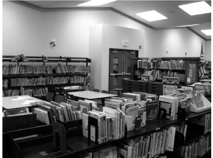
A portion of the elementary library in the Park Falls building.

Cash on hand plus receivables (uncollected state aids, grants, and property taxes) minus current unpaid bills.